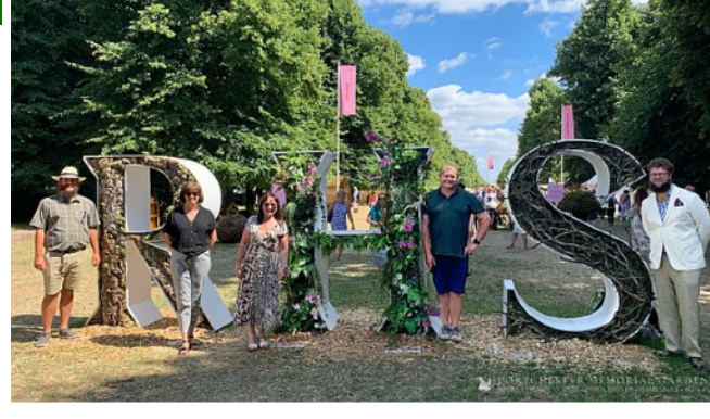
PMG visit to Hampton Court Flower Show

Fruit producing planting - we are delighted to have had a good crop of pears, grapes, currents and apples and welcome our visitors to pick the ripe fruit (just ask one of our gardening team!)